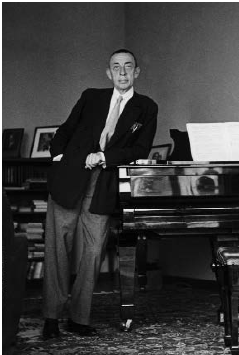
Serge Rachmaninoff in his studio at Senar (1938)