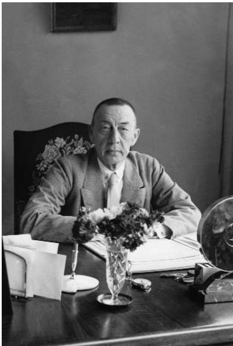
Serge Rachmaninoff in his studio at Senar (1938)