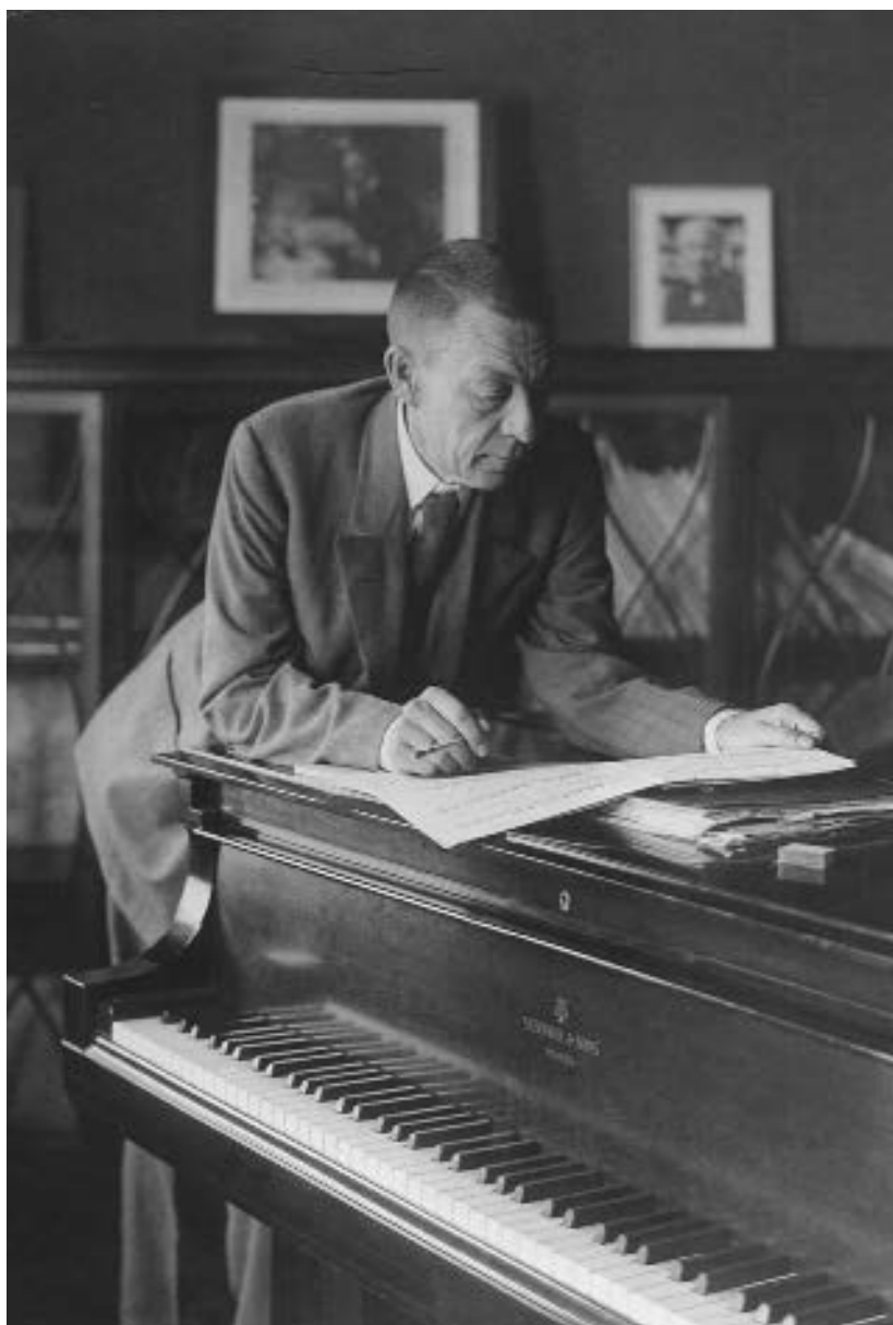
Serge Rachmaninoff at his piano (Senar, 1936)