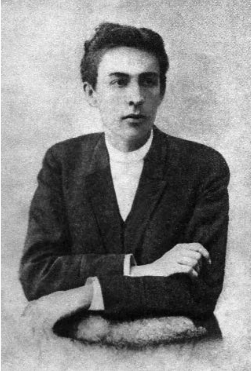
Serge Rachmaninoff (1895-97)