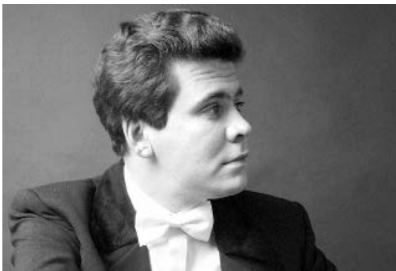
Pianist and Board Member Denis Matsuev

Since 2007, the pianist Denis Matsuev has been Ambassador and Artistic advisor of the Serge Rachmaninoff Foundation and has greatly contributed to the success of the promotion of the composer's musical message to audiences of the 21st century.