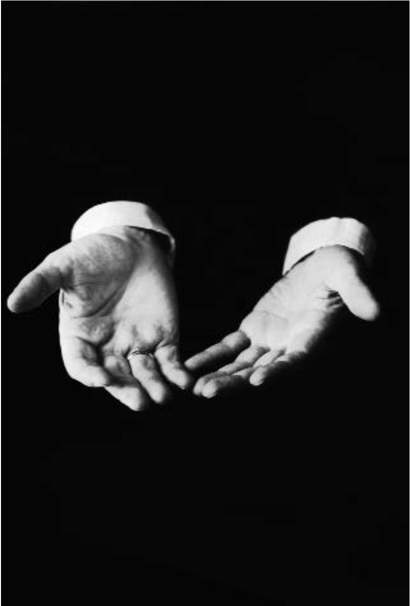
Serge Rachmaninoff's hands