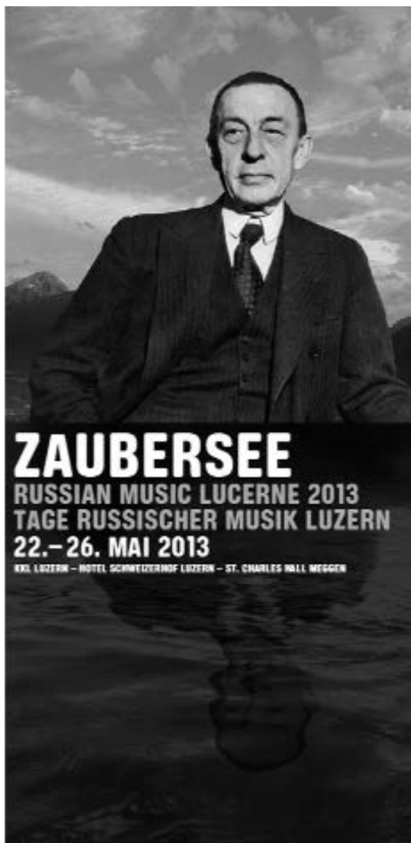
The Poster of the Zaubersee Festival 2013