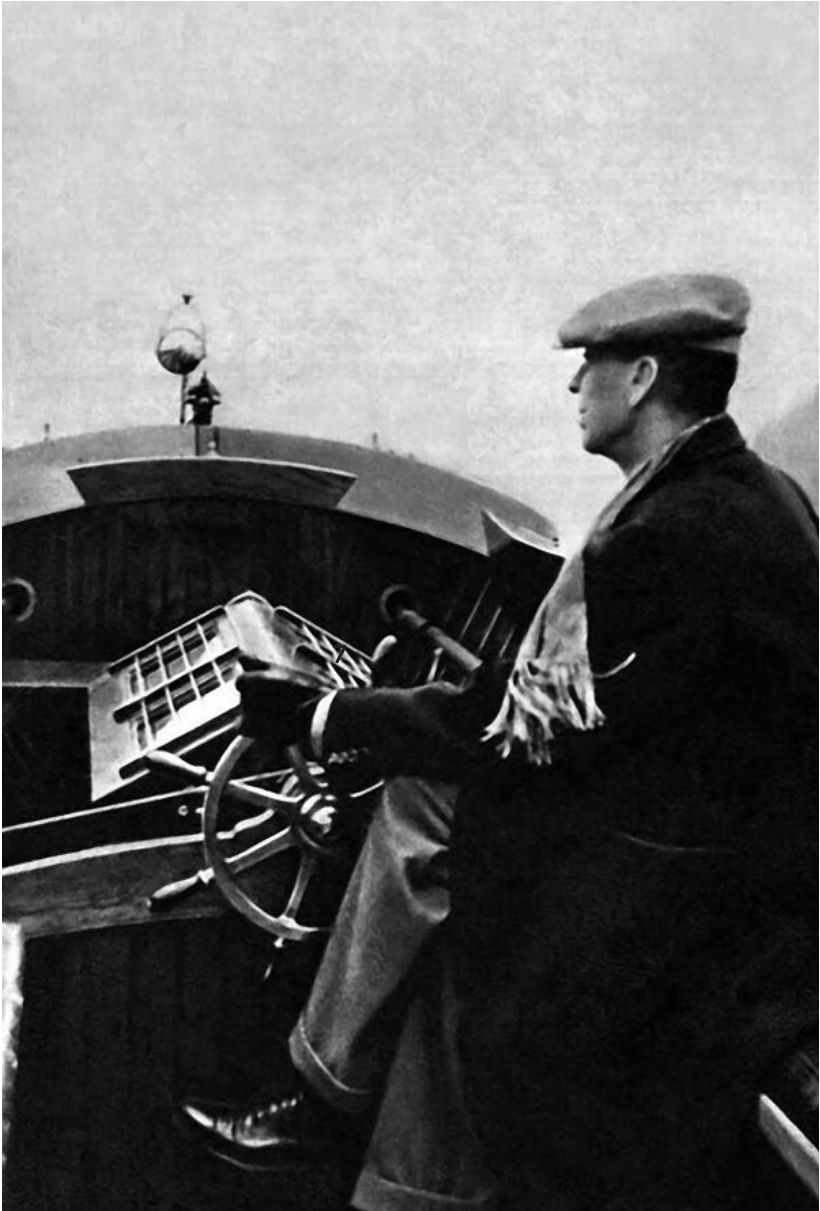
Serge Rachmaninoff driving his boat (1938)