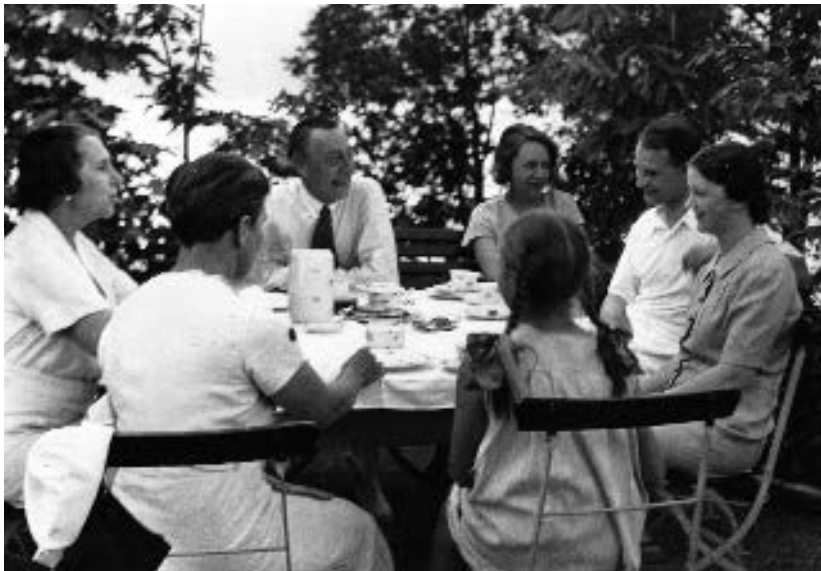
Serge Rachmaninoff and his family at Senar (1934)